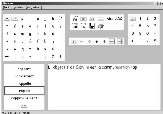
Figure 1: The interface of the SIBYLLE AAC system

improvement consists in minimizing the number of keystrokes: the system tries to predict the words which are likely to occur just after those already typed. Several approaches can be used to carry out this prediction, among which language models that provide a list of word suggestions, depending on the n (typically 1-4) last inserted words. Other, more complex models (structural model, e. g. Schadle et al, 2004) can be used, but we will limit ourselves here to a tri-gram model giving already satisfactory results.